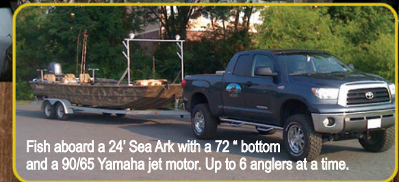
Fish aboard a 24' Sea Ark with a 72" bottom and a 90/65 Yamaha jet motor. Up to 6 anglers at a time.

Outlaw Guide Service offers specialized adventures in catching big flatheads or channel cats on the Susquehanna but if fishing on the Potomac River is what you want, give us a call for all the details. We can set you up with an 8 hour charter trip.